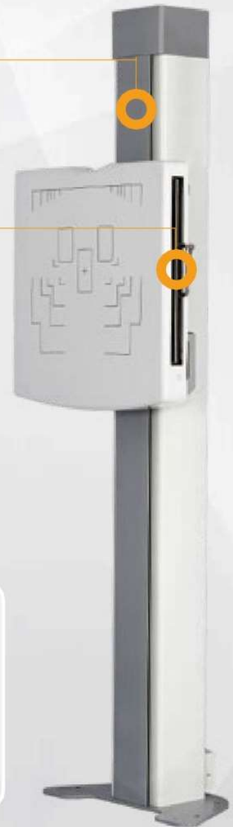
Floor-mounted Tube stand (Option)