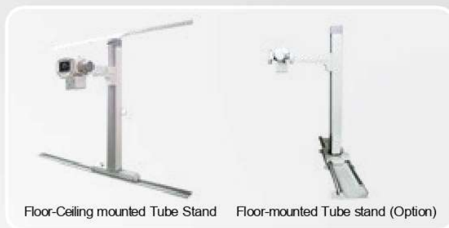
Floor-Ceiling mounted Tube Stand